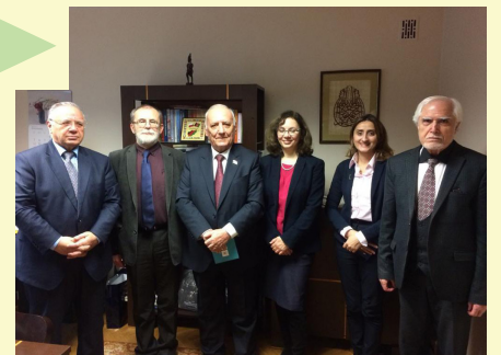
Meeting with Azerbaijani scholars visiting the Faculty of Oriental Studies at the University of Warsaw