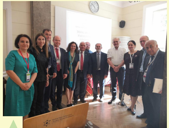
Participants and guests of the Azerbaijani-Polish Conference on "Crimes against Humanity: Experience of Azerbaijan and Poland in the 20th Century" organized by the Centre for Azerbaijani Studies in June 2019