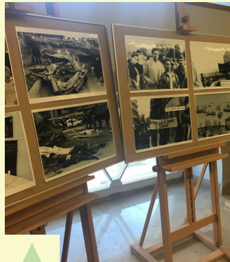
Photo exhibition organized by the Centre at the University of Warsaw during the International Conference "Black January in Azerbaijan – Suppression of Popular Uprisings in the Era of Communism" (February 2019)