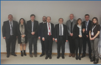
The Centre at glance