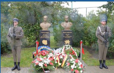
Azerbaijani officers serving in the Polish Army