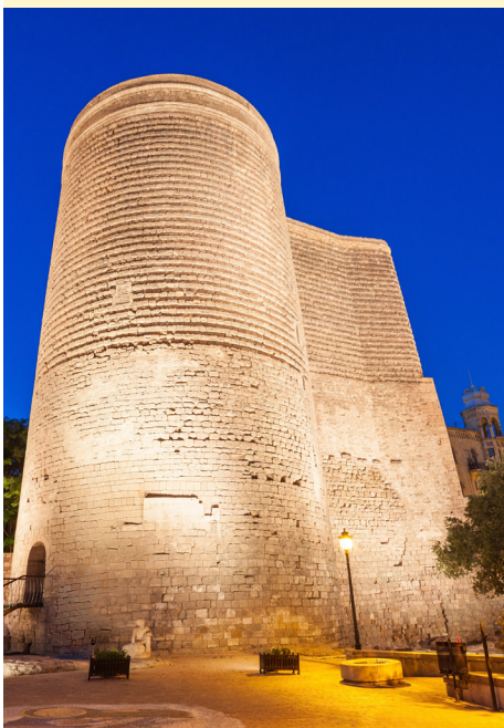
The Maiden Tower is an ancient monument in the Old City, Baku